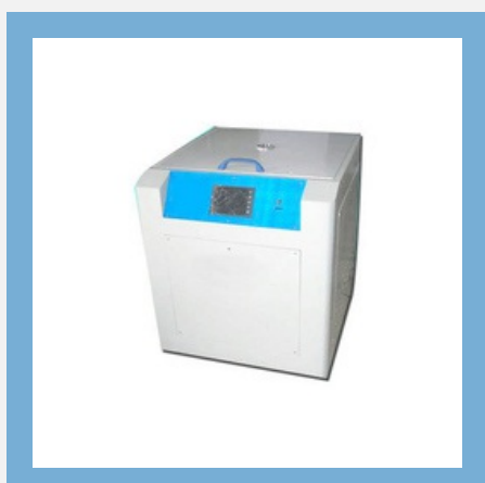
Refrigerated Centrifuge Machine

With the support of our experts we offer a wide range of Scientific Lab Equipments to our clients for affordable price. We offer different types of scientific lab equipments like refrigerated centrifuge machine, bio safety cabinets and biological oxidation incubator.