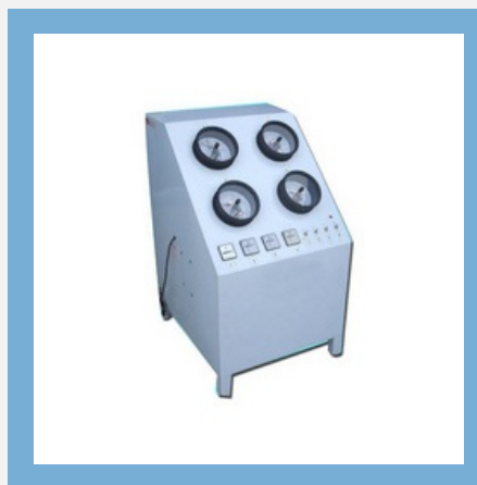
Digital Pressure Testing Machine