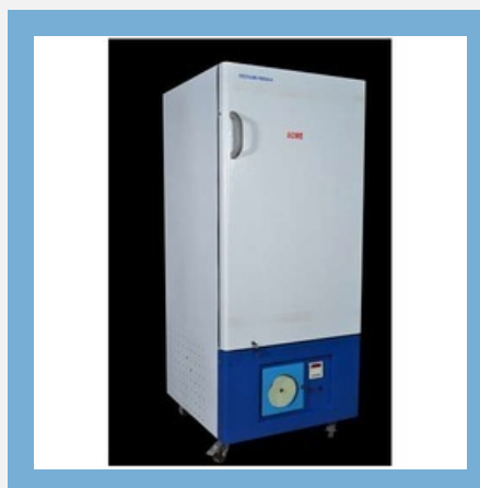
ACME Plasma Freezer