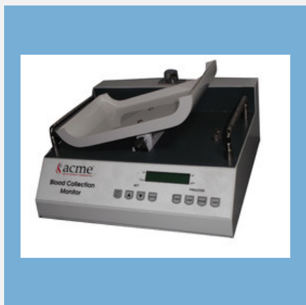
Blood Collection Monitor