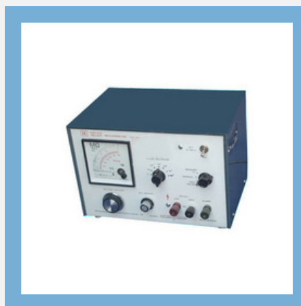
High Voltage Stabilizer