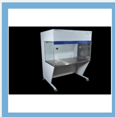
Laminar Air Flow Benches