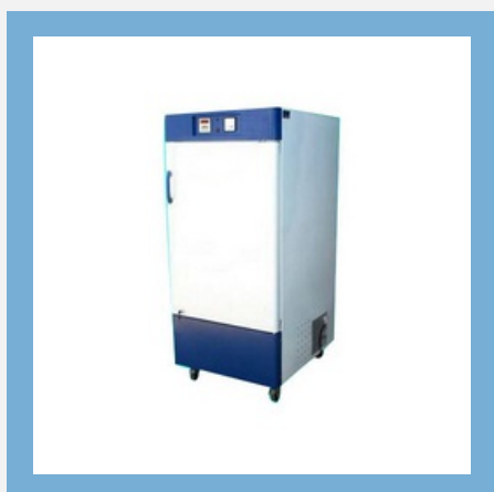
Biological Oxidation Incubator