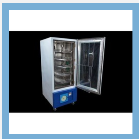
Blood Storage Cabinet

We have emerged as extremely reliable and highly professional manufacturer and supplier of world class range of Blood Bank Refrigerators that are designed for quick freezing and storing of plasma and allied blood components at desired low temperature.