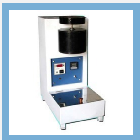
Melt Flow Index

We offer different types of Industrial Lab Equipments such as Melt Flow Index, Tensile Testing Machine Panel, High Voltage Stabilizer And Digital Pressure Testing Machine. Our ranges of products are well known for their high quality, optimum performance, long service life and durability.