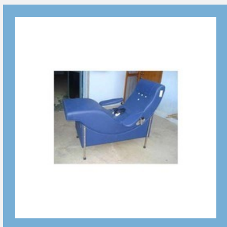
Donor Couch Motorized

We offer an extensive range of Blood Bank equipment which is sourced from reliable and trusted partners. Blood Bank Machines designed for the precise requirements of blood banking and processing applications. The concern is headed by eminent and efficient technical professionals.